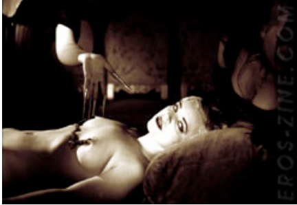
From Ladies of the Night: Les Vampyres

great creativity that seduced me to live in Paris. The notion of erotic liberation and unlimited expression of sensuality and aesthetic appreciation for eroticism too. Taking erotic vision to a higher level as an art form rather than porno merchandise.